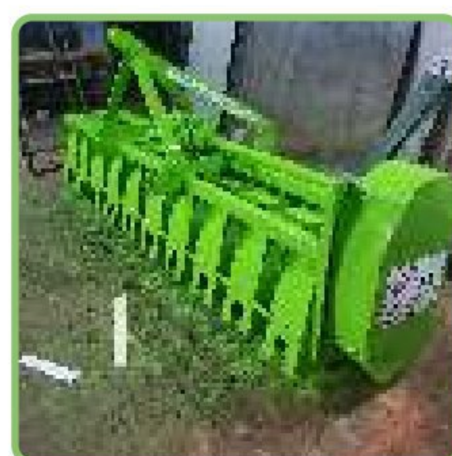
Tractor Operated Rotary Weeder S. Baljinder Singh (Sangrur)