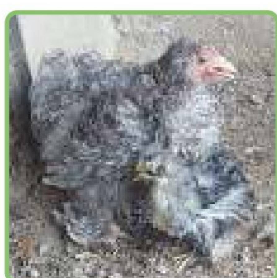
New Strain of Poultry S. Talwinder Singh (Jalandhar)