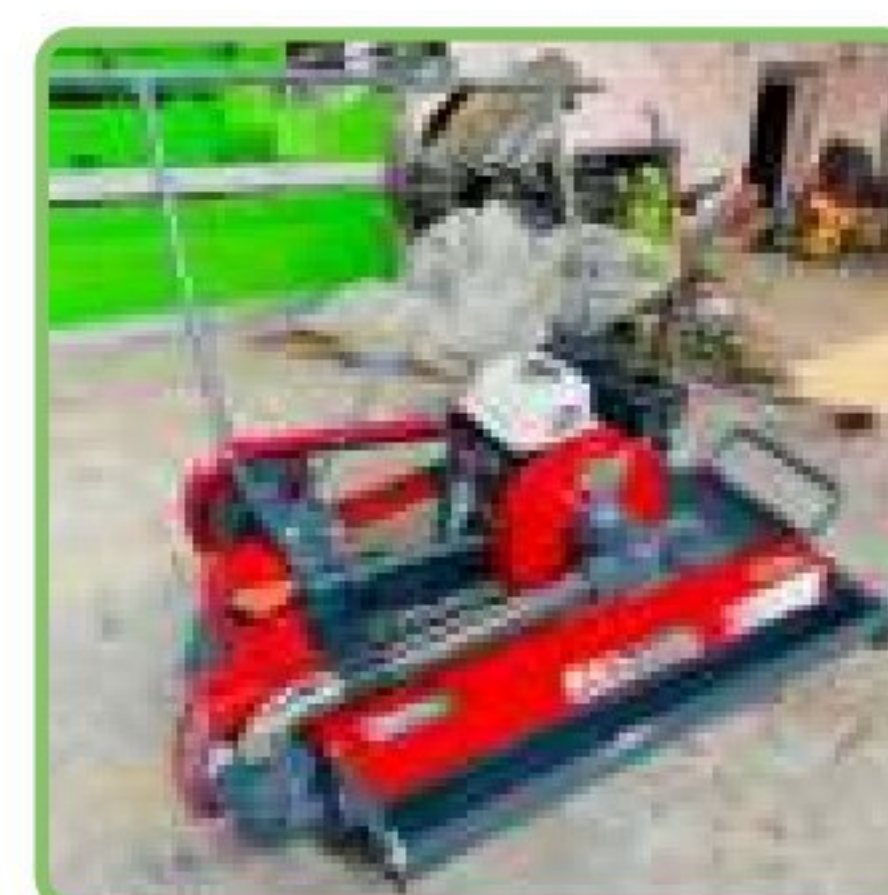
Multi Seed Sowing Machine for Nursery S. Jaswinder Singh (Malerkotla)