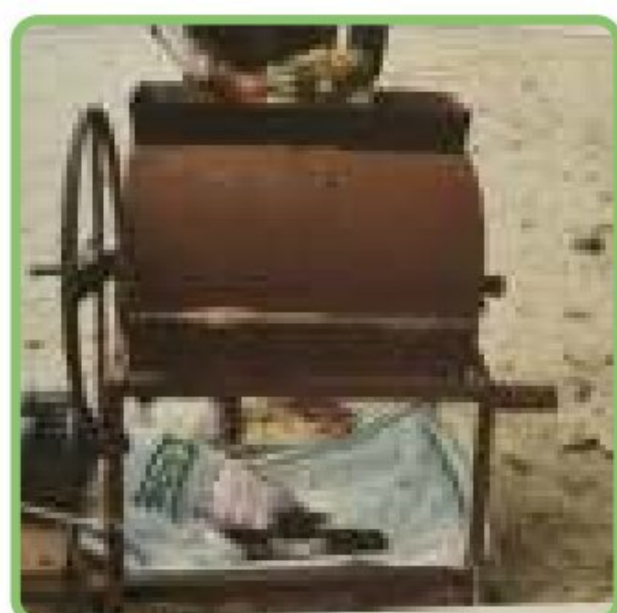
Portable Onion Flower (umbels) Thresher cum Seed Extractor S. Sukhjot Singh (Ludhiana)