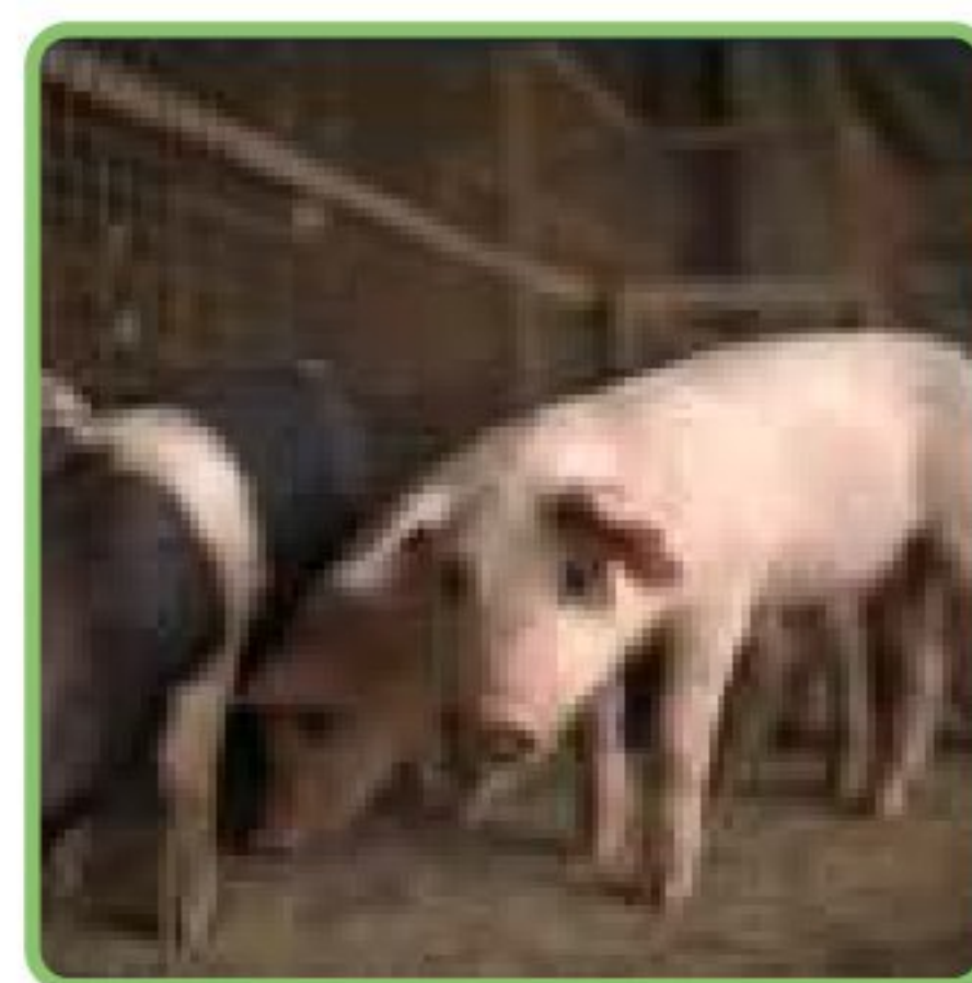
New Cross in Piggery S. Sukhwinder Singh Grewal (Ludhiana)