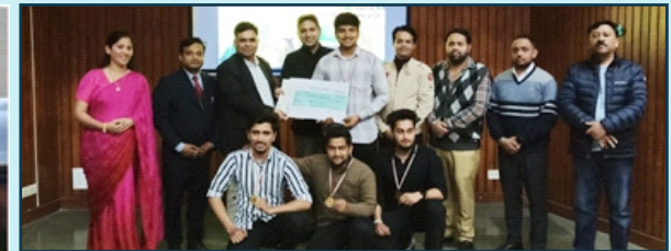
Department Technical Fest Technophillia