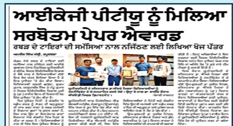
Best paper Presentation by students in Conference