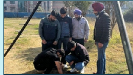
FIELD LAB TESTING