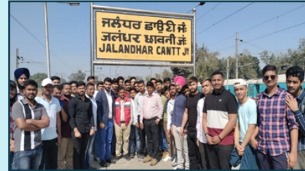
Field Visit to Jalandhar Cantt Junction