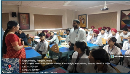
CAREER GUIDANCE AT MGN SCHOOL KAPURTHALA