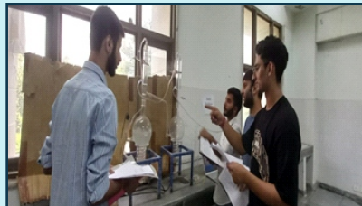
Environment Engg Lab