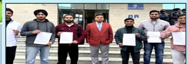
Internship of students