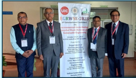
CONFERENCE PARTICIPATION BY FACULTY