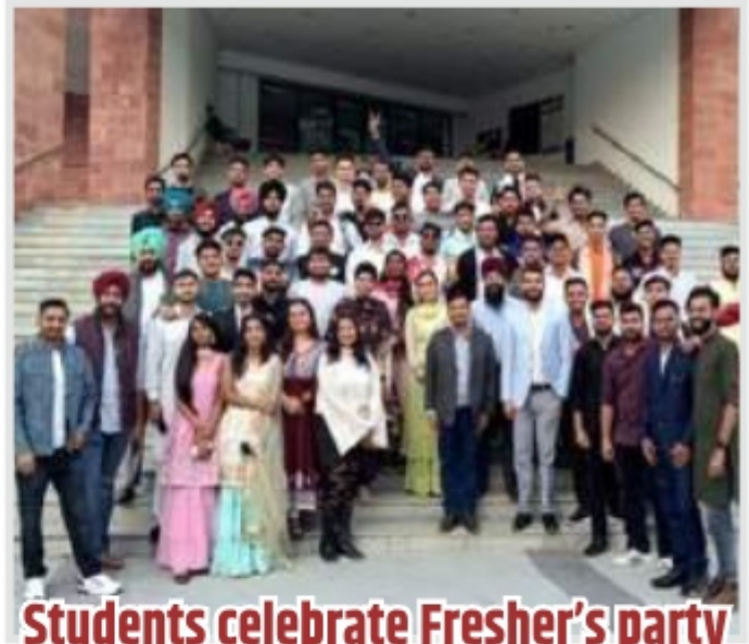
Students celebrate Fresher's party (AGHAZ) on November 18, 2023