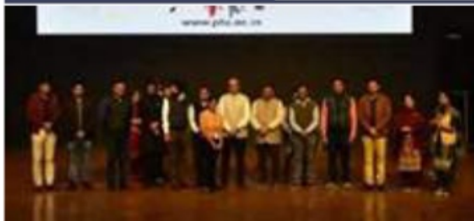
Inter zonal youth fest 2022 held on - 30th November, 2022 at main campus kapurthala (Mannat 2nd year) 1st position in creative writing.