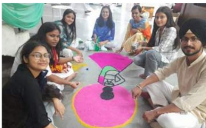
RANGOLI MAKING as part of Diwali celebrations 21st October 2022.