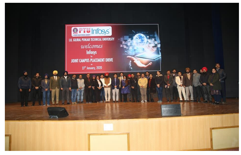
Infosys Ltd. - Joint Campus Placement Drive