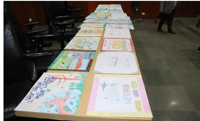
Posters made by students on display