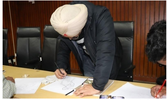
Students making poster on World Wetlands Day