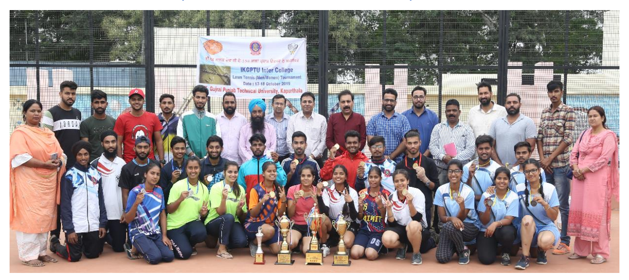
Inter-College Lawn Tennis Tournament held at Main Campus, IKGPTU