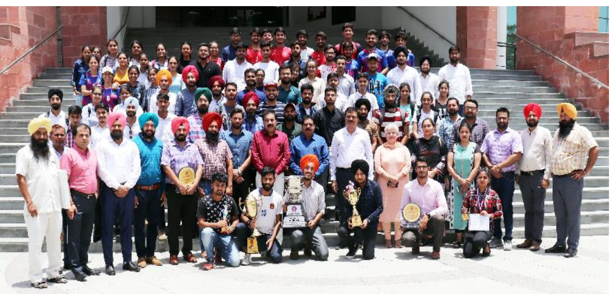
Annual prize distribution held at Main Campus, IKGPTU