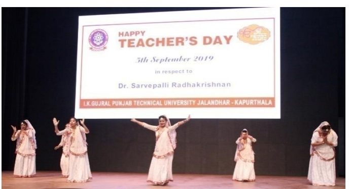
Teacher's Day Celebrations