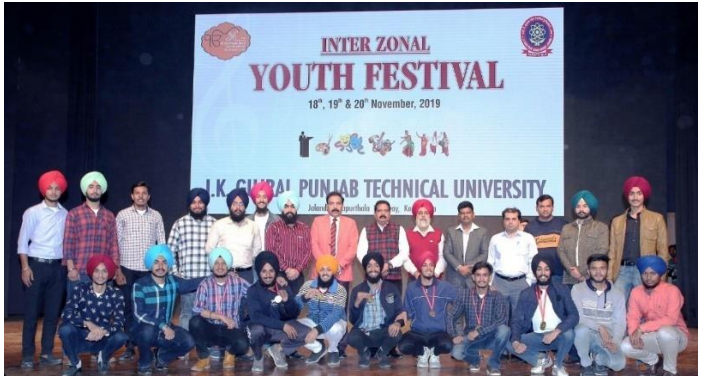
Inter-Zonal Youth Festival