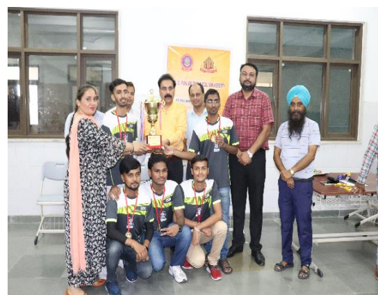
Inter-College Chess Tournament held at Main Campus, IKGPTU