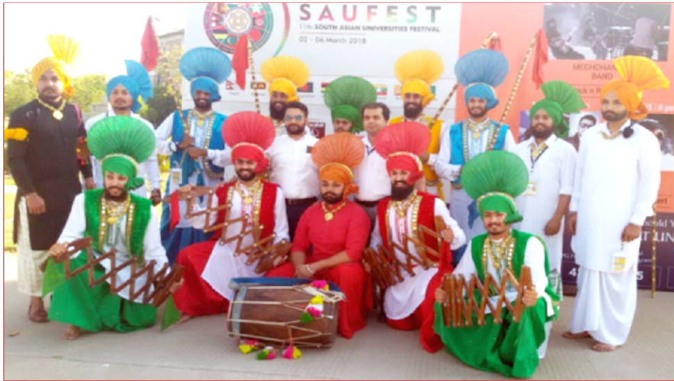
Folk dance team of University participated in 11th South Asian Universities at Ganpat University, Gujarat

The Department of Youth Affairs organizes various cultural events on Teacher's day, Engineer's day, Republic day, Independence Day, Zonal & Inter-Zonal Youth Festivals, Youth Leadership Training Camps, Teacher's Training Camp for cultural Co-ordinators of affiliated colleges. To polish the hidden talent of students, Department of Youth Affairs organizes various Training Camps of Music, Dance, Theatre, Fine Arts & Literary. The selected students in these Camps represent the University in North Zone Inter-University and National Youth Festivals. This Year, University Folk Dance Team also participated in 11th South Asian Countries Inter-University Youth Festival at Ganpat University, Gujrat organised by Association of Indian University, New Delhi. To Honour & motivate the winners of Inter-University Youth Festival University reimburse the tuition fees of the Participants.