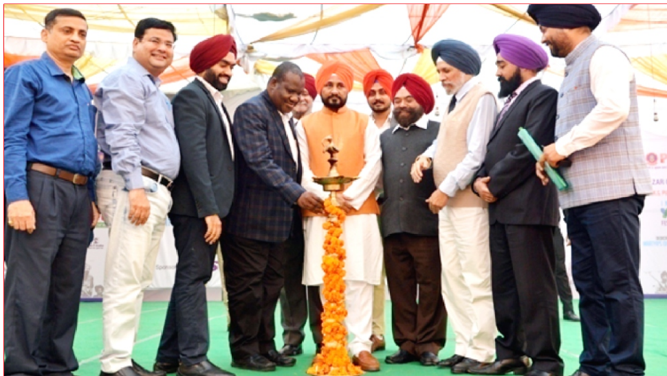
Inauguration of Inter Zonal Youth Festival by Honorable S. Charanjit Singh Channi, Technical Education Minister