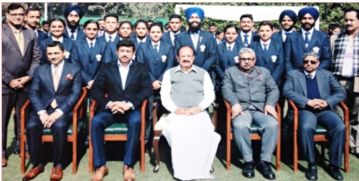
University Students with Honorable Vice President of India after the Republic Day parade held at Raj Path, New Delhi on 26th January 2018.