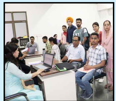
Record Enrollment of other state students in Admission session 2022-23

With the objective of better practical training to the students, I.K.Gujral Punjab Technical University (IKGPTU) ..... Page 26