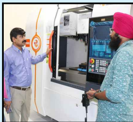
IKGPTU's Institute CIIT Provides Training to ITI students