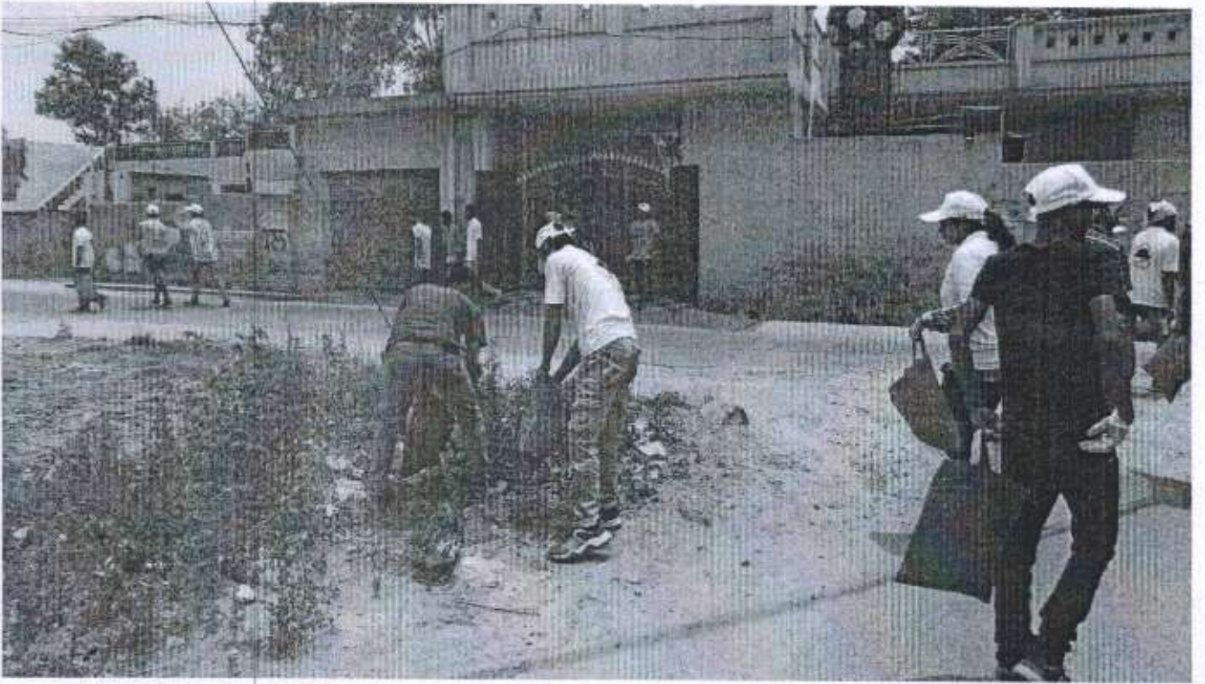
Photograph of World Environment Day